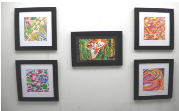
Artwork created by art students at the Clearview Drop-in Center.